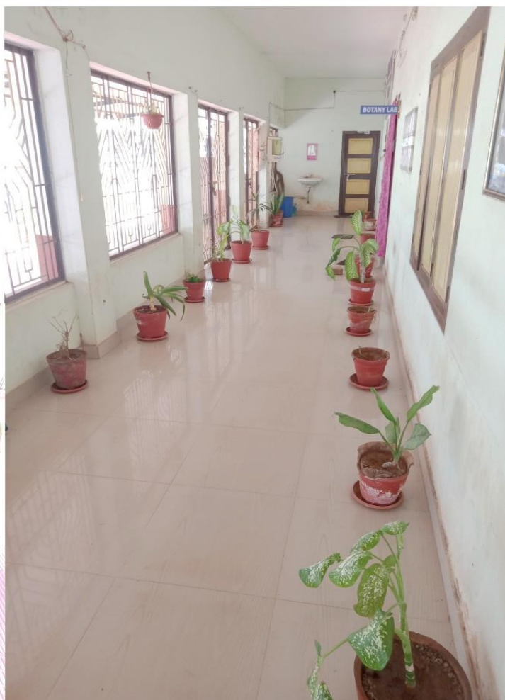
Dept. of Botany