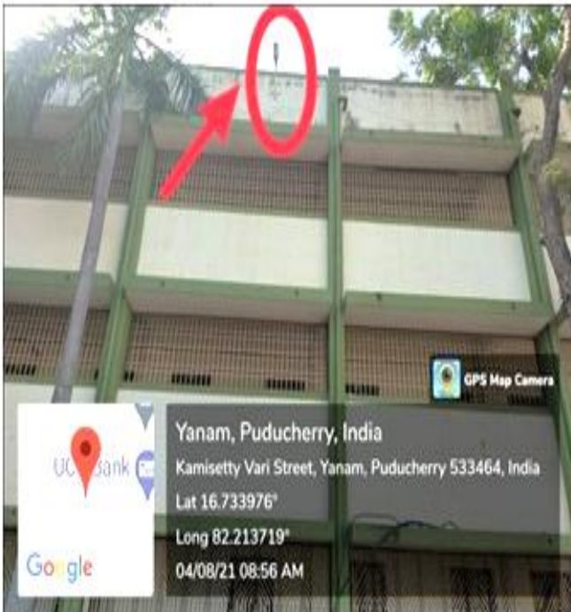
LED Fitting @ Academic Block