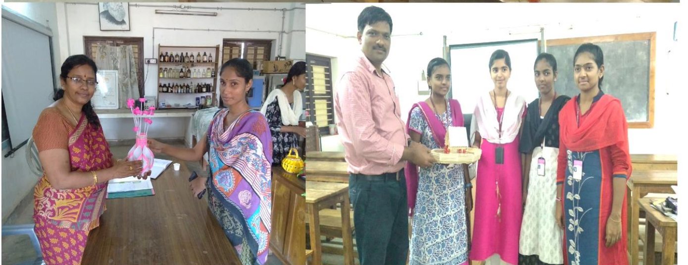
Eco-friendly items prepared by students with solid and paper waste