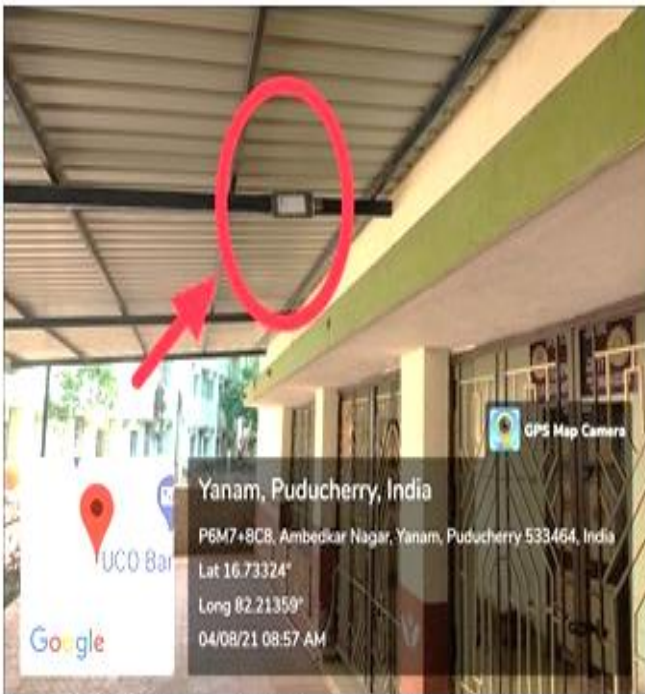
LED Fitting @ Botany Department