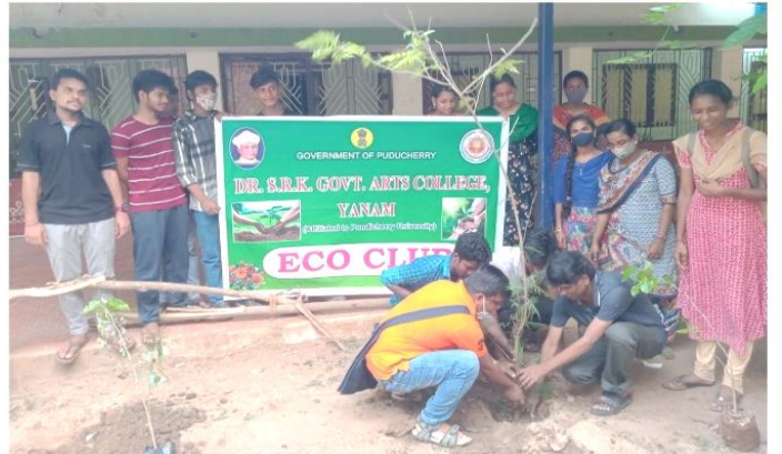
Plantation programs in Botanical Garden by NSS & Eco club Units