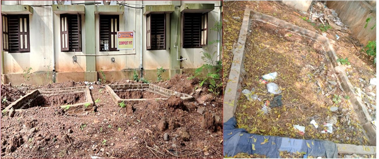
Compost Units at Academic block and Botany block