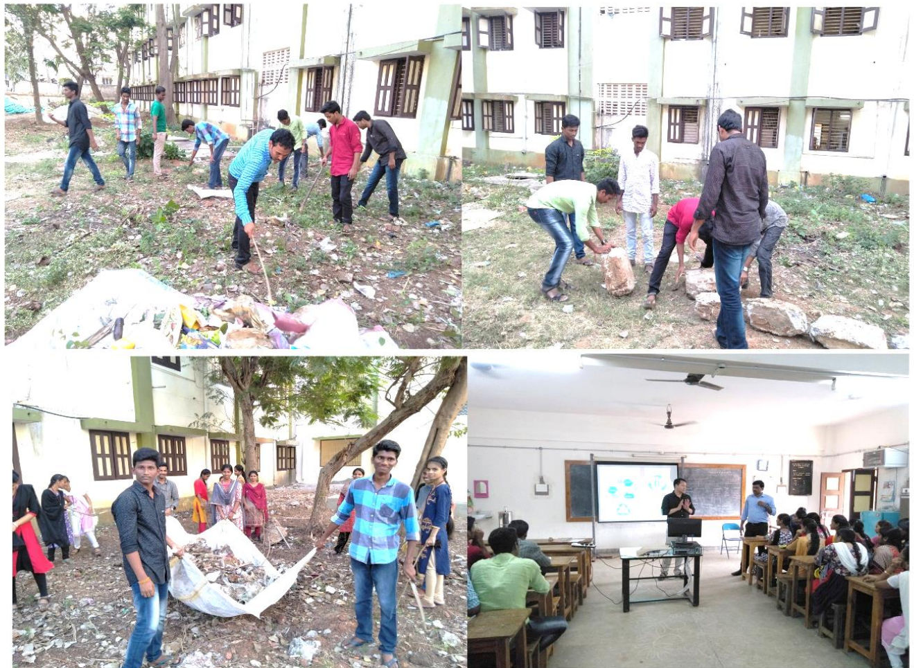
Collection of solid waste and awareness lecture on solid waste management