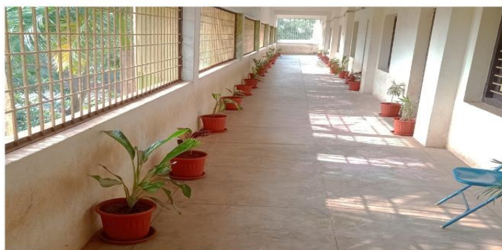
Dept. of Economics