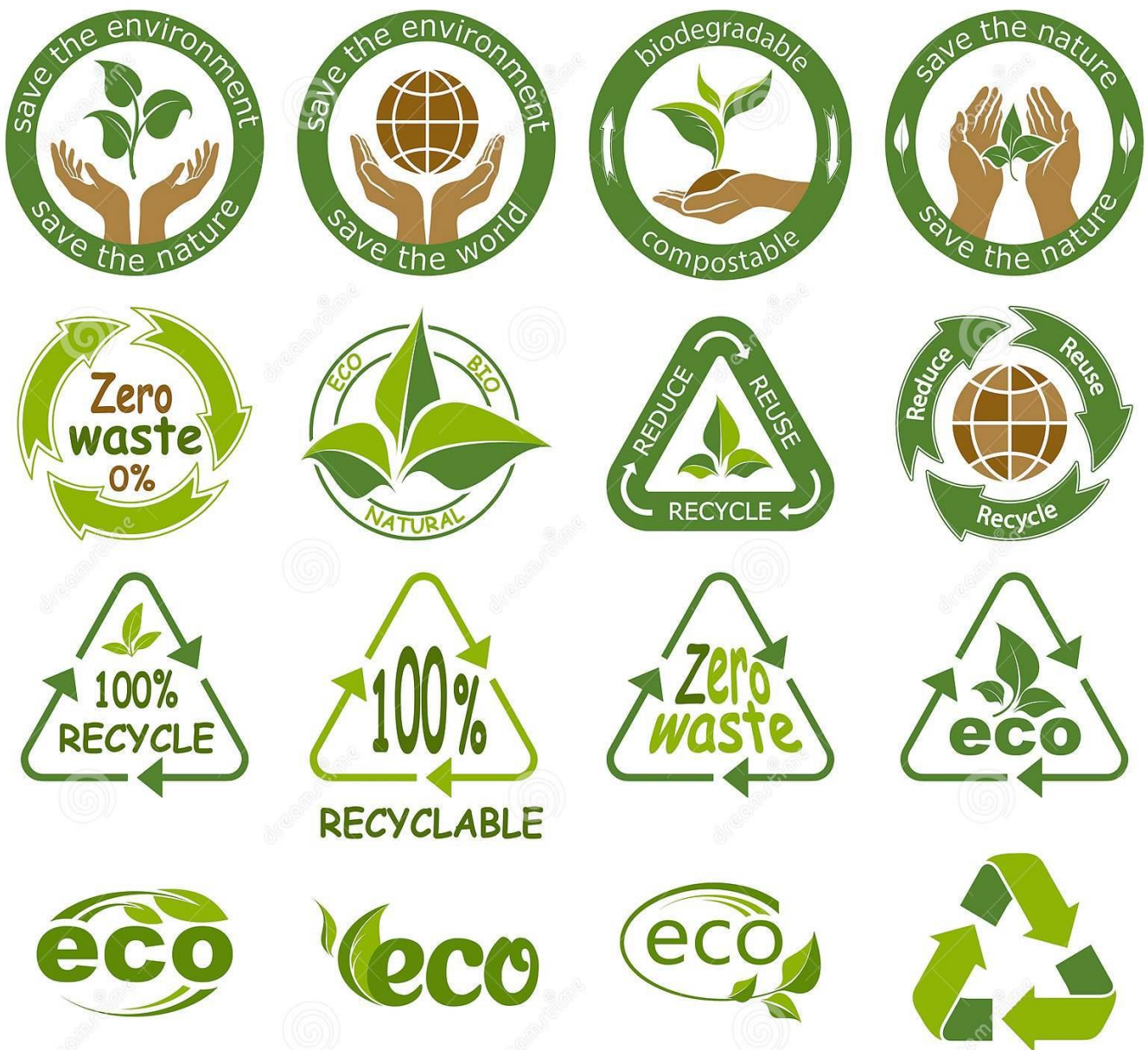
Popular Green Initiatives to be practiced in the college campus

Considering the above-mentioned facts, the environmental awareness initiatives taking by the college are significant. The plantation programmes, developing botanical garden, keeping potted plants in the corridors of each department, solid waste management and composting pits, using LED tube lights and lamps are noteworthy steps. Few recommendations are added to curb the menace of waste management using eco-friendly and scientific techniques, construction of Vermi-compost units, further garden development, repairing of leakage water taps, installation of Solar energy photovoltaic cells on terrace etc. This may lead to the prosperous future in context of Green Campus of the college, and thus sustainable environment and community development of Yanam region.