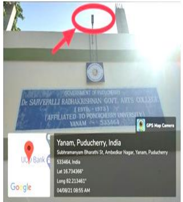
LED Fitting @ Administrative Block