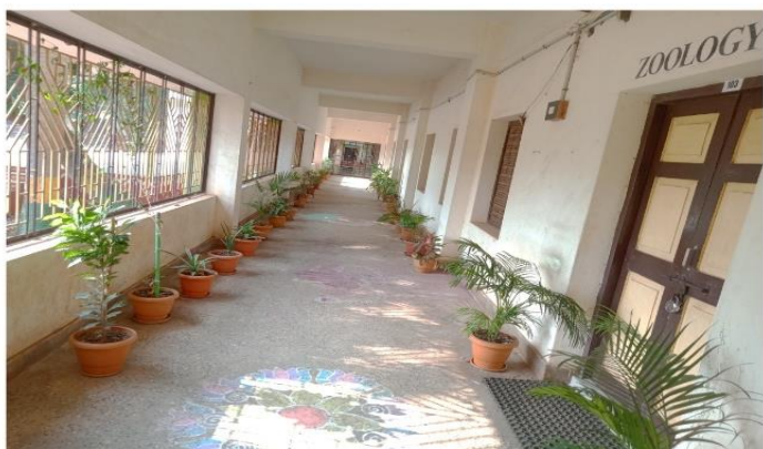
Dept. of Zoology