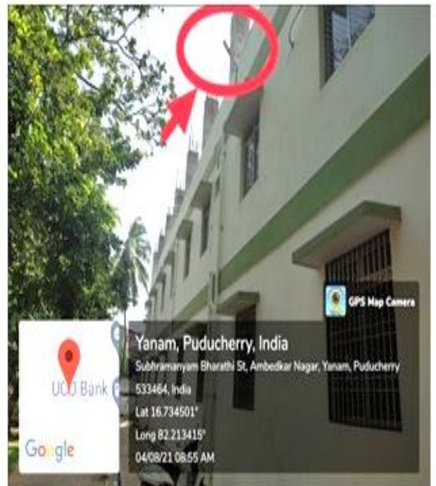
LED Fitting @ Administrative Block