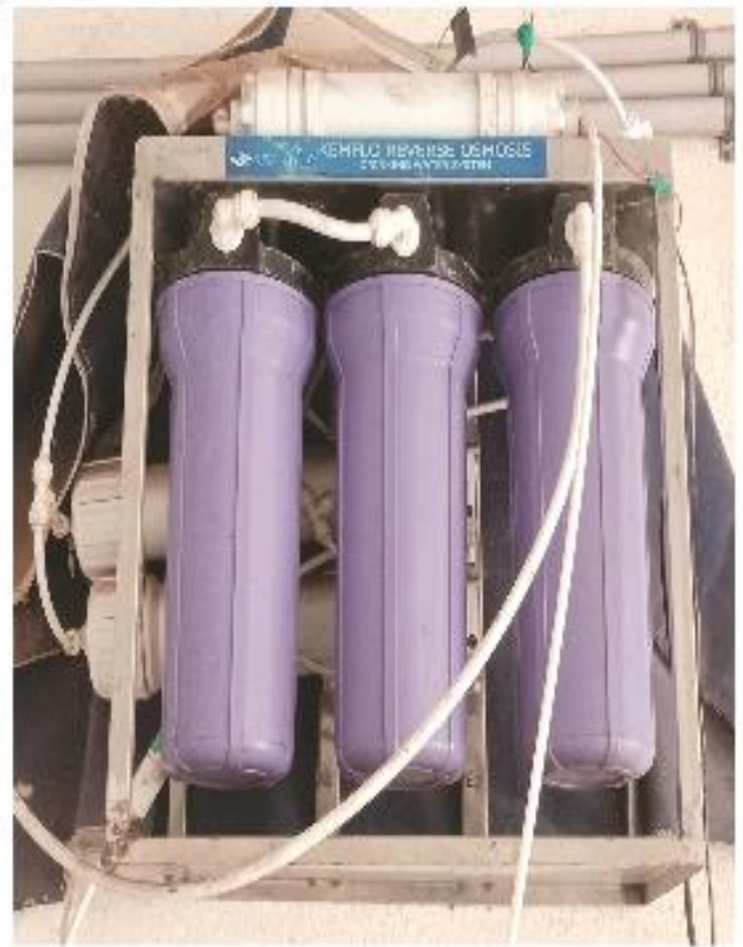
RO Purifiers in Academic & Administrative Blocks