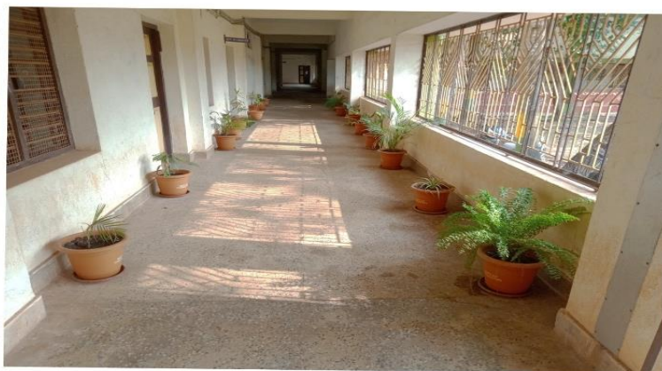
Dept. of Chemistry